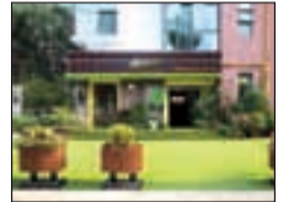
Day care center

Additionally 1,500 hospital beds will be added in the district.