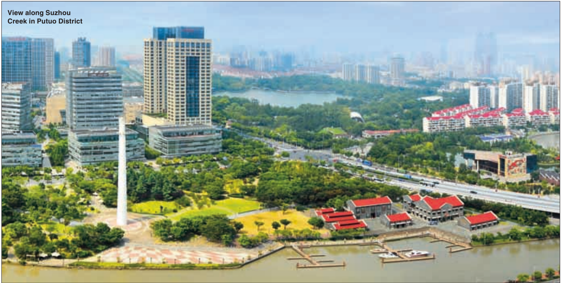
View along Suzhou Creek in Putuo District